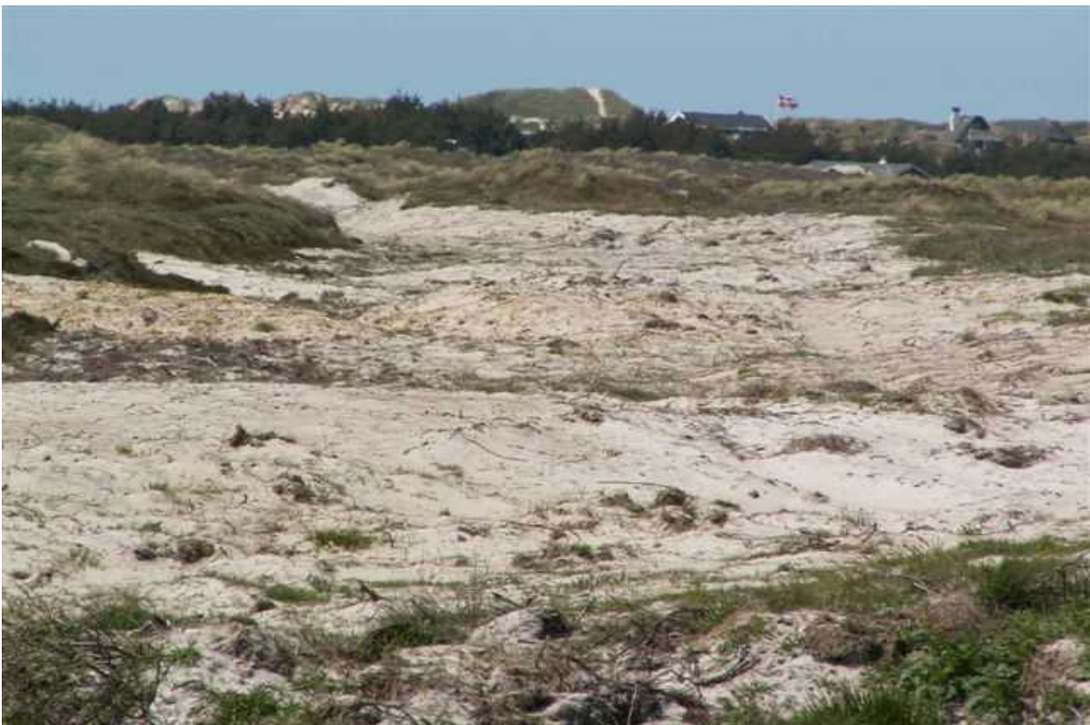
Reconstructed dune heath, June 2005