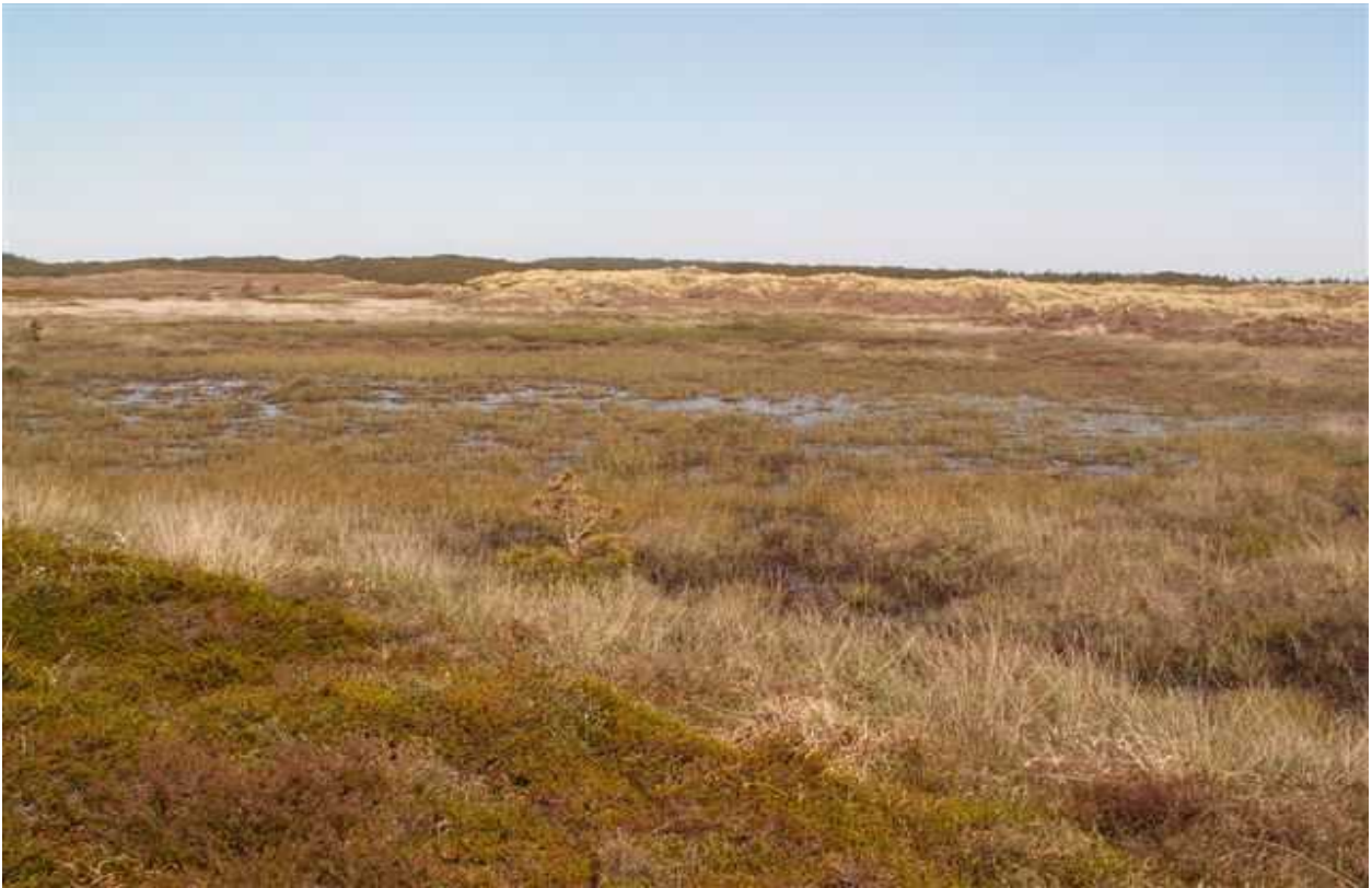
Water on the heath, June 2005