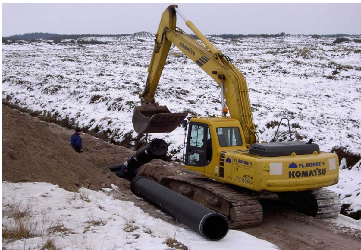
Laying down pipes