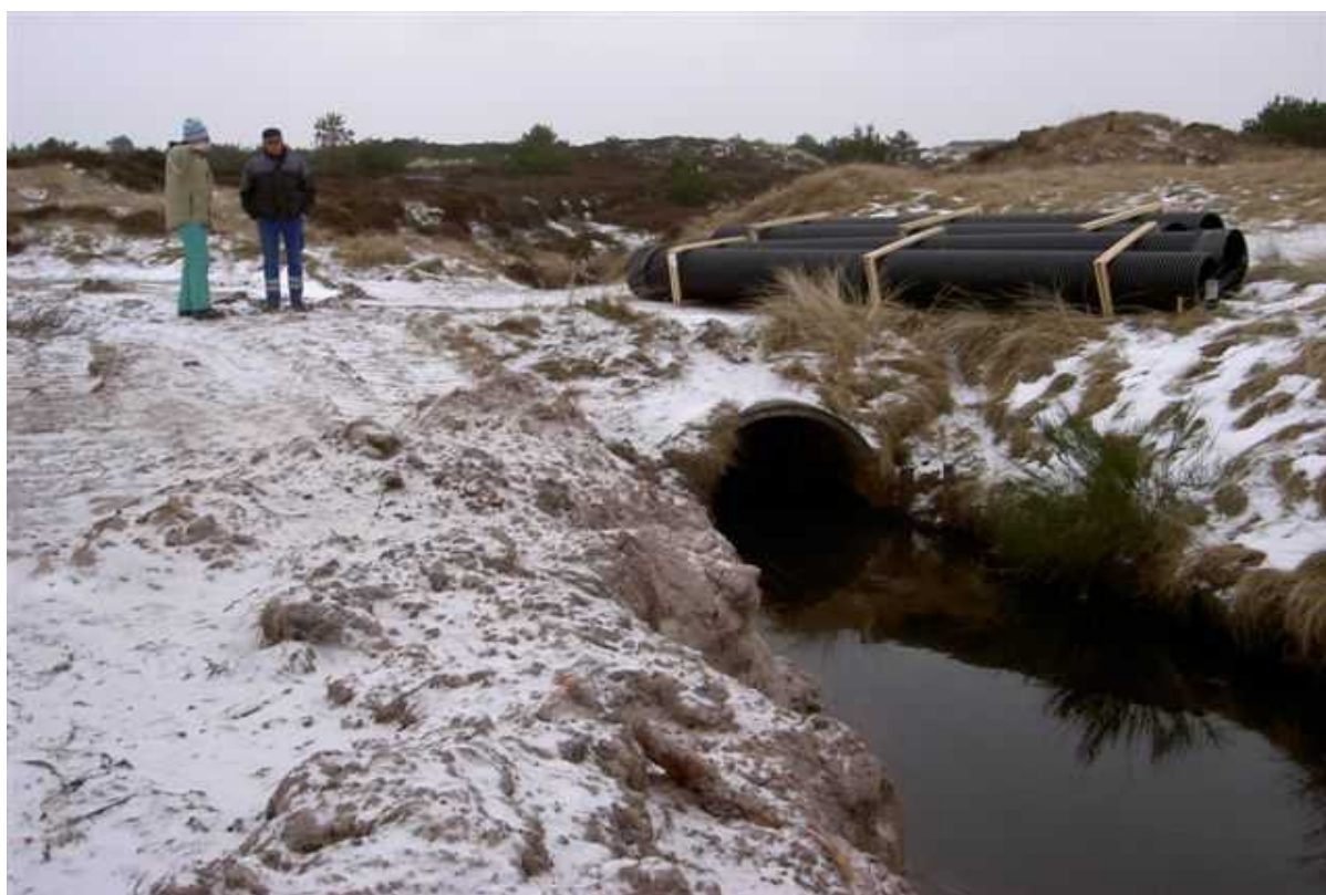
Laying down pipes