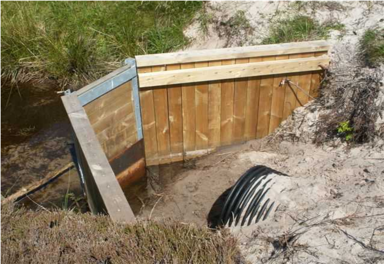
Establishment of weirs